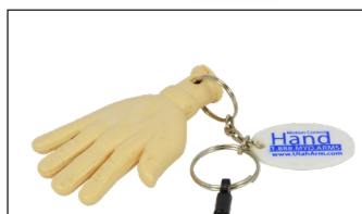
Figure 2: Interrupter Plug

The MC wire harness does not have an on/off switch. If you have an electric wrist rotator, such as the MC ProWrist, the system needs to be either plugged into the charger, or powered off when not in use. To power off the system, insert the interrupter plug (provided) into the charging port, and the system is turned off. This plug is attached to a convenient key fob ( Figure 2 ).