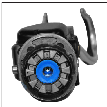
MC Standard ETD blue coax receptacle.